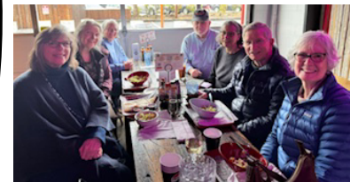
Happy Hour at Firehouse Axes